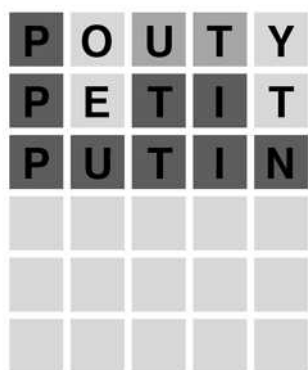
BOB STAAKE FOR THE WASHINGTON POST